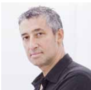
Hani Rashid Asymptote Architects