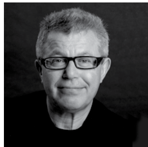
Daniel Libeskind Daniel Libeskind Studio